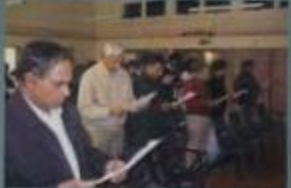
PATRIOTS READING WAR HERO SLOGAN

The war hero remembrance is not a new concept to the New Zealanders. Since the first anniversary of the Gallipoli landing in 1916, ANZAC Day has evolved to acknowledge the sacrifice and service of subsequent wars and to encompass new understandings of the full impact of armed conflict on those who have served their country.