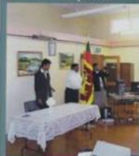
HOISTING THE NATIONAL FLAG