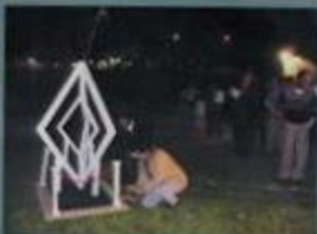
LIGHTING CANDLES IN FRONT OF THE MONUMENT

The ceremony ended at dusk with lighting lamps and reading a war hero slogan in front of the War Hero monument.